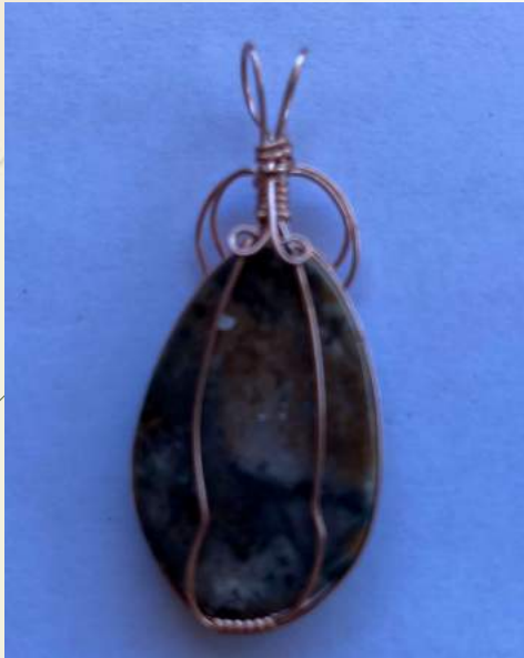
Back of Pendant

Shape back wire inward to hold stone into place.